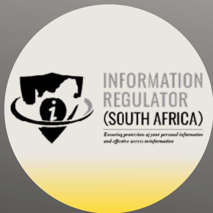
Information Regulator SA