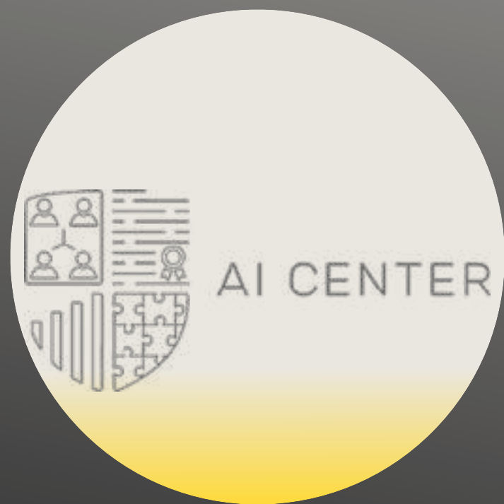
AI Center Sweden