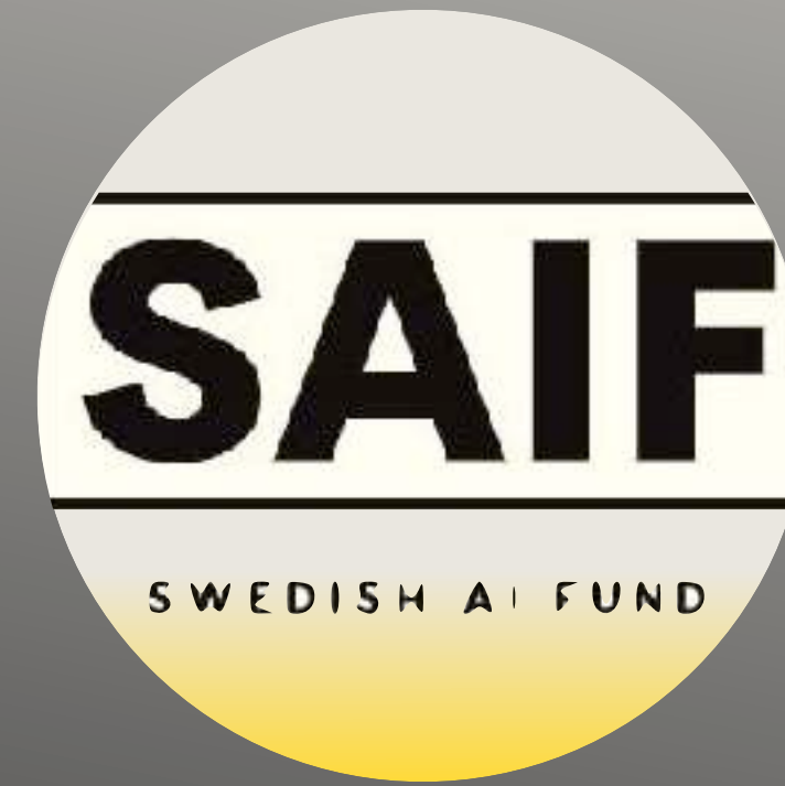
Swedish AI Fund