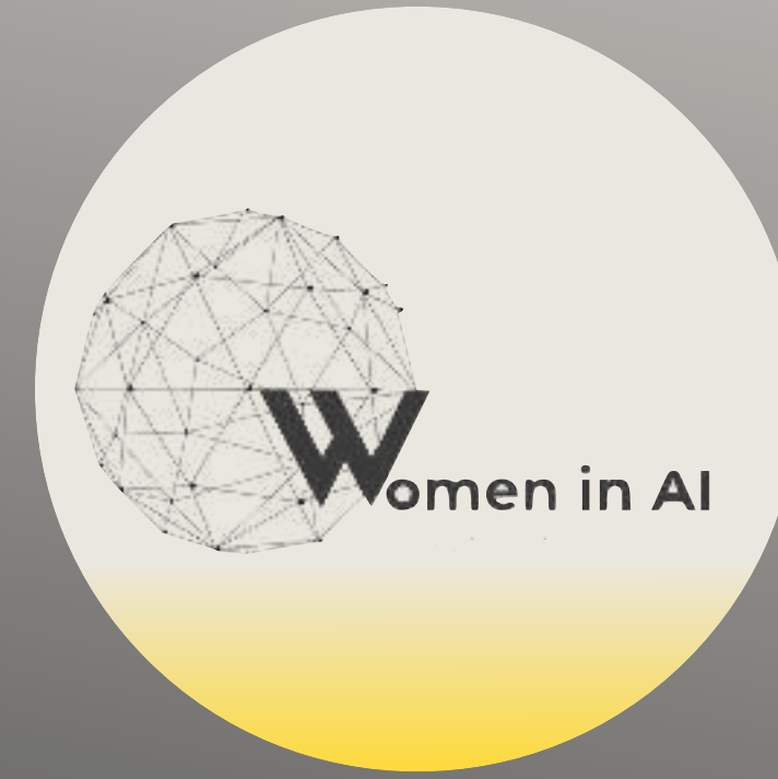
Women In AI